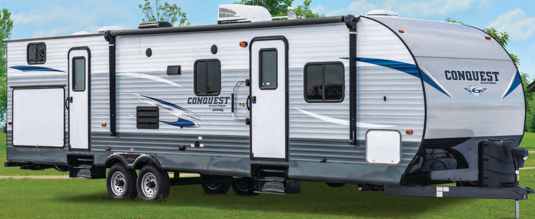
Our 323TBR with two entry doors and outside kitchen