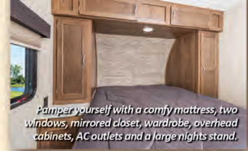
Pamper yourself with a comfy mattress, two windows, mirrored closet, wardrobe, overhead cabinets, AC outlets and a large nightstand.