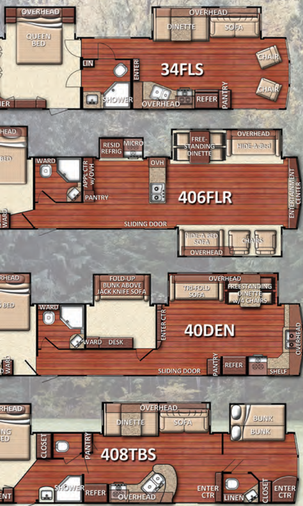
34FLS Slide Room showing Dinette with underseat Storage, Sofa, Overhead Cabinet, large picture windows with soft pleated shades, and Entertainment Center with optional HDTV and Fireplace.