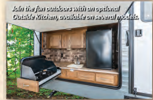
Join the fun outdoors with an optional Outside Kitchen, available on several models.